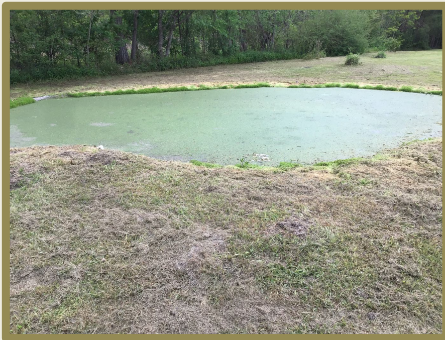
Sewage being pumped to cesspool