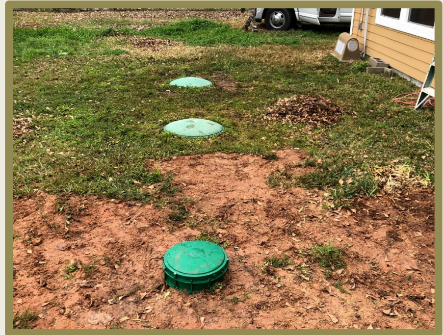
Repaired aerobic system