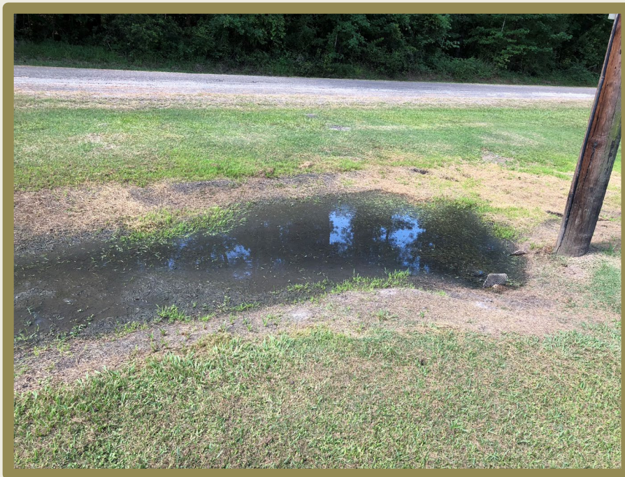
Wastewater discharged to ditch