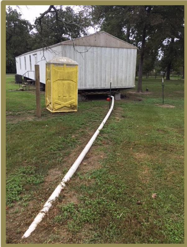
Line to failed conventional system