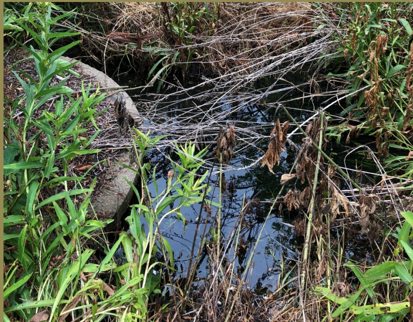
Failing conventional system draining to ditch