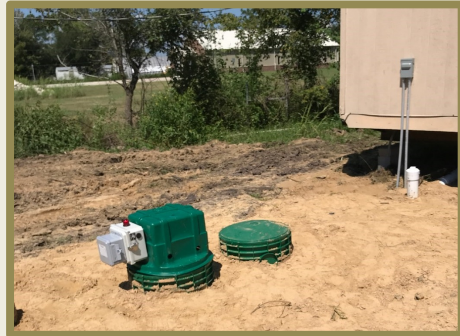
New aerobic OSSF