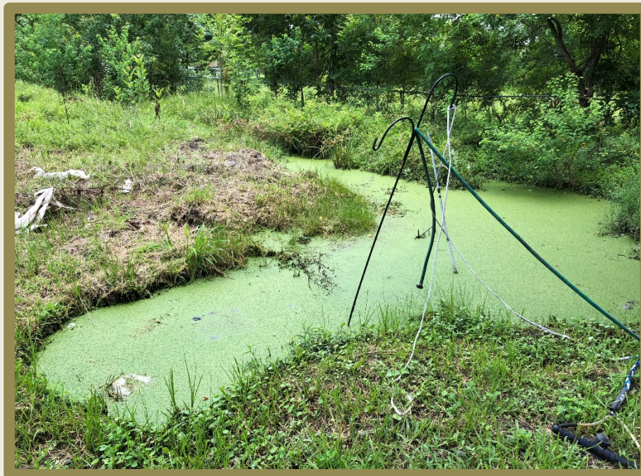
Sewage discharging to cesspool