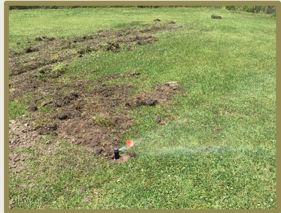
New aerobic OSSF with spray field