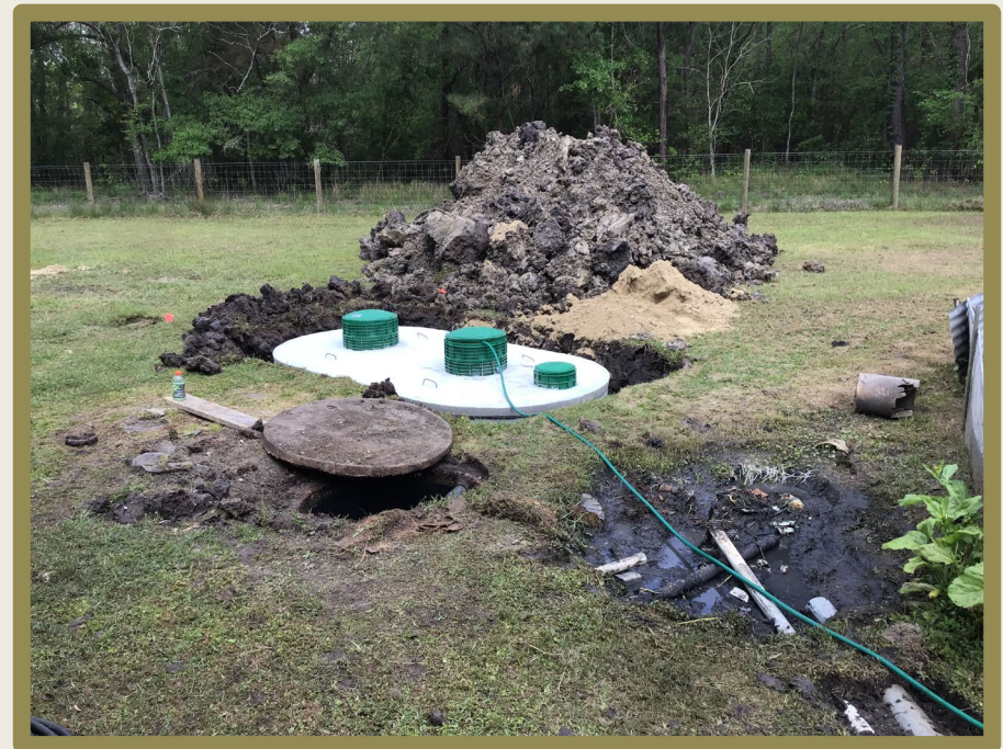
Installation of new aerobic OSSF