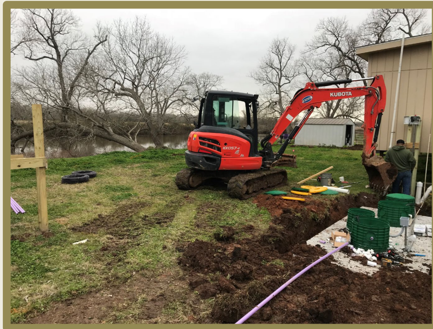
New aerobic OSSF