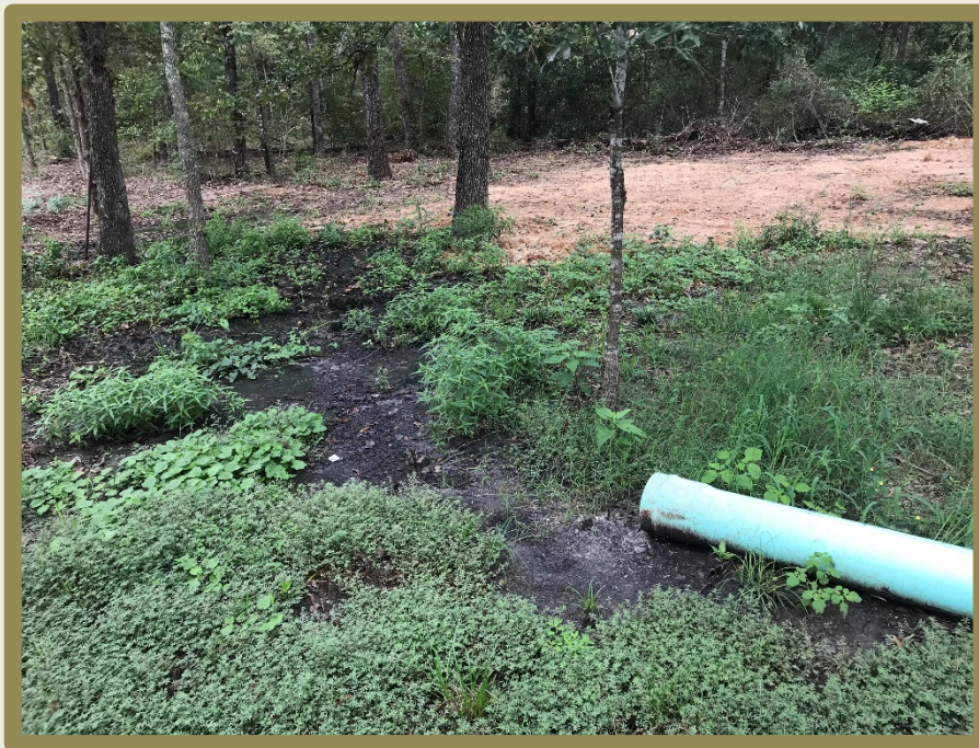
Pipe discharging to field