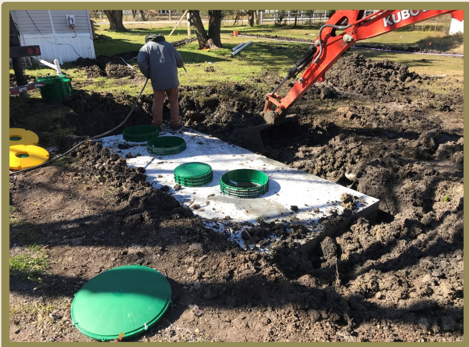
New aerobic OSSF