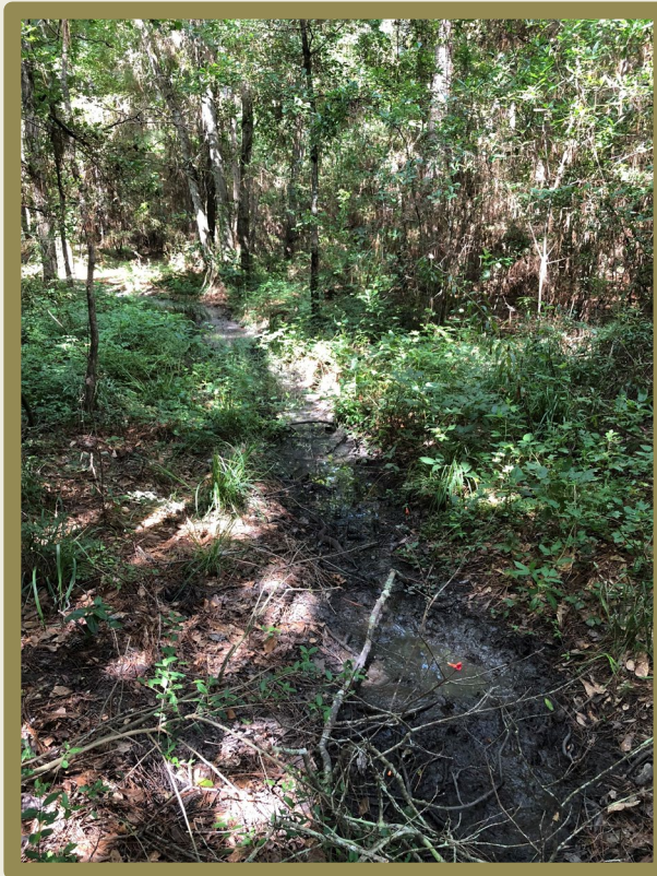
Pipe discharging to woods