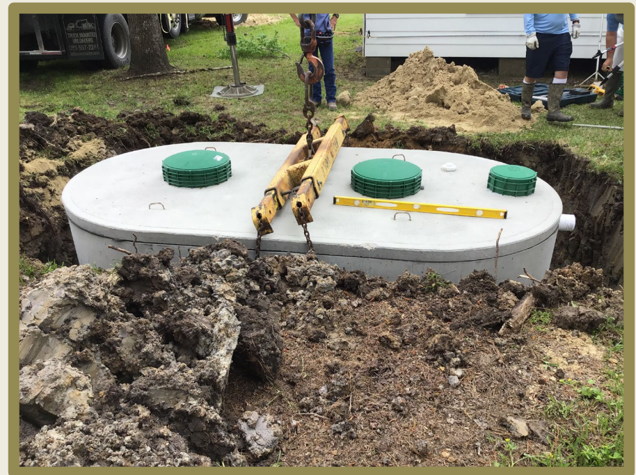
Installation of new aerobic OSSF