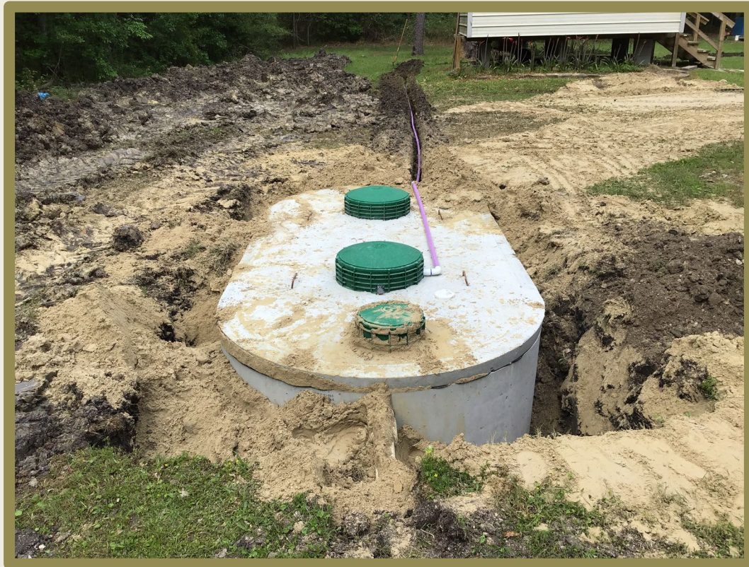
New aerobic OSSF