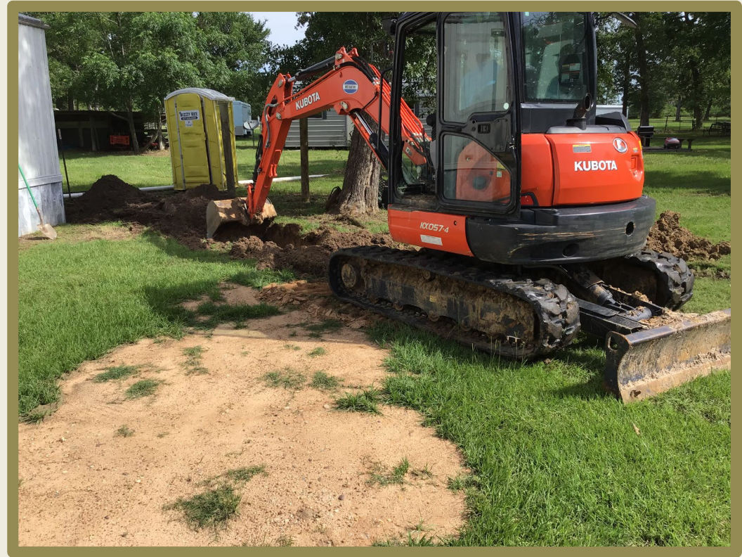
Installation of new system