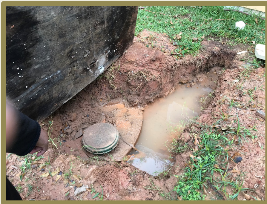
Failed connection from home to tank