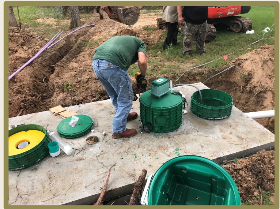
New aerobic OSSF