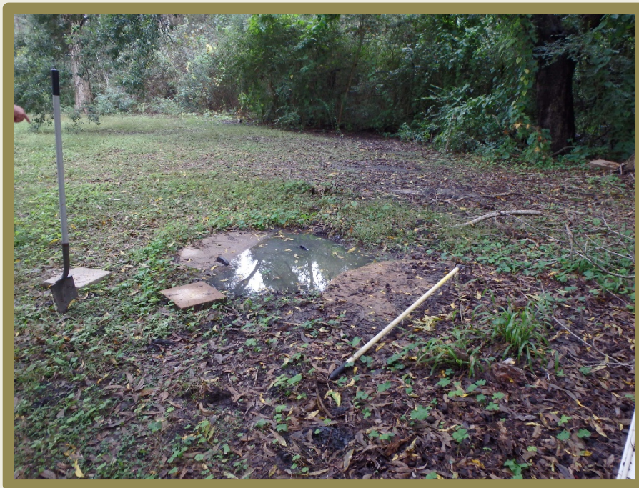
Failed conventional system