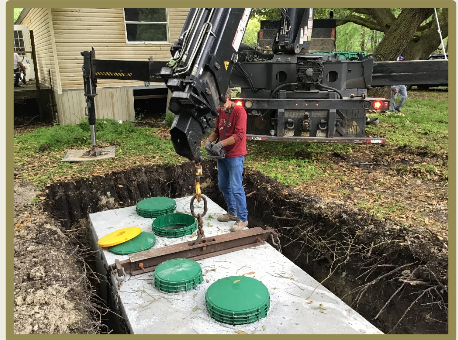
New aerobic OSSF