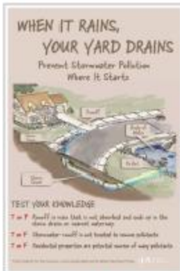
LOW IMPACT DESIGN DISPLAY AND MATERIALS (FOCUS ON STORMWATER)