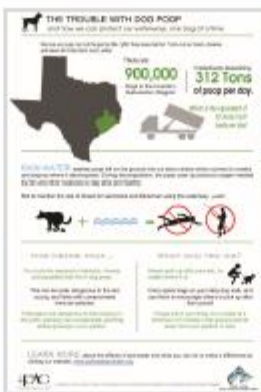
PITCH THE POOP INTERACTIVE GAME AND MATERIALS (FOCUS ON BACTERIA)