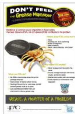
DEFEAT THE GREASE MONSTER DISPLAY AND MATERIALS (FOCUS ON FATS, OILS, GREASE DISPOSAL)