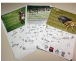
PLEDGE SHEETS FOR ALL THREE DISPLAYS