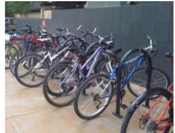
TX Medical Center