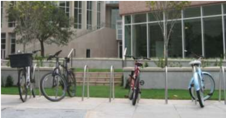
TX Medical Center