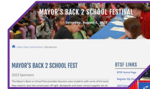
COH Mayor's Back to School Festival