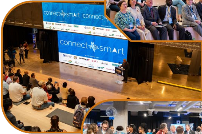
ConnectSmart App Launch, Sep 2022