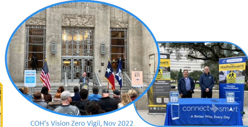
COH's Vision Zero Vigil, Nov 2022