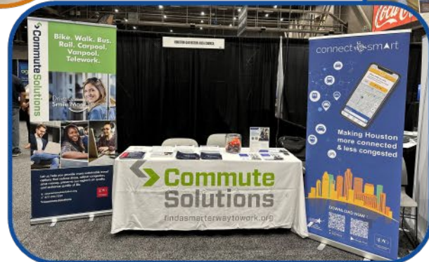
HR Conference, 2022 and 2023