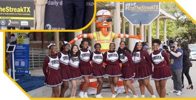
#EndTheStreakTX, Nov 2022