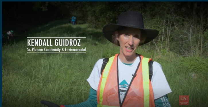
Click video above to learn more about this year's event.

Nearly 2,500 volunteers came together on March 25 to clean more than 108 miles of shoreline at this year's River, Lakes, Bays, N' Bayous Trash Bash®. Volunteers were spread across 14 locations collecting 40.51 tons of trash , 0.38 tons of recyclables , and 219 illegally dumped tires . Afterwards, volunteers enjoyed picnics and educational exhibits and games at each of the 14 locations to learn about the common sources of water pollution.