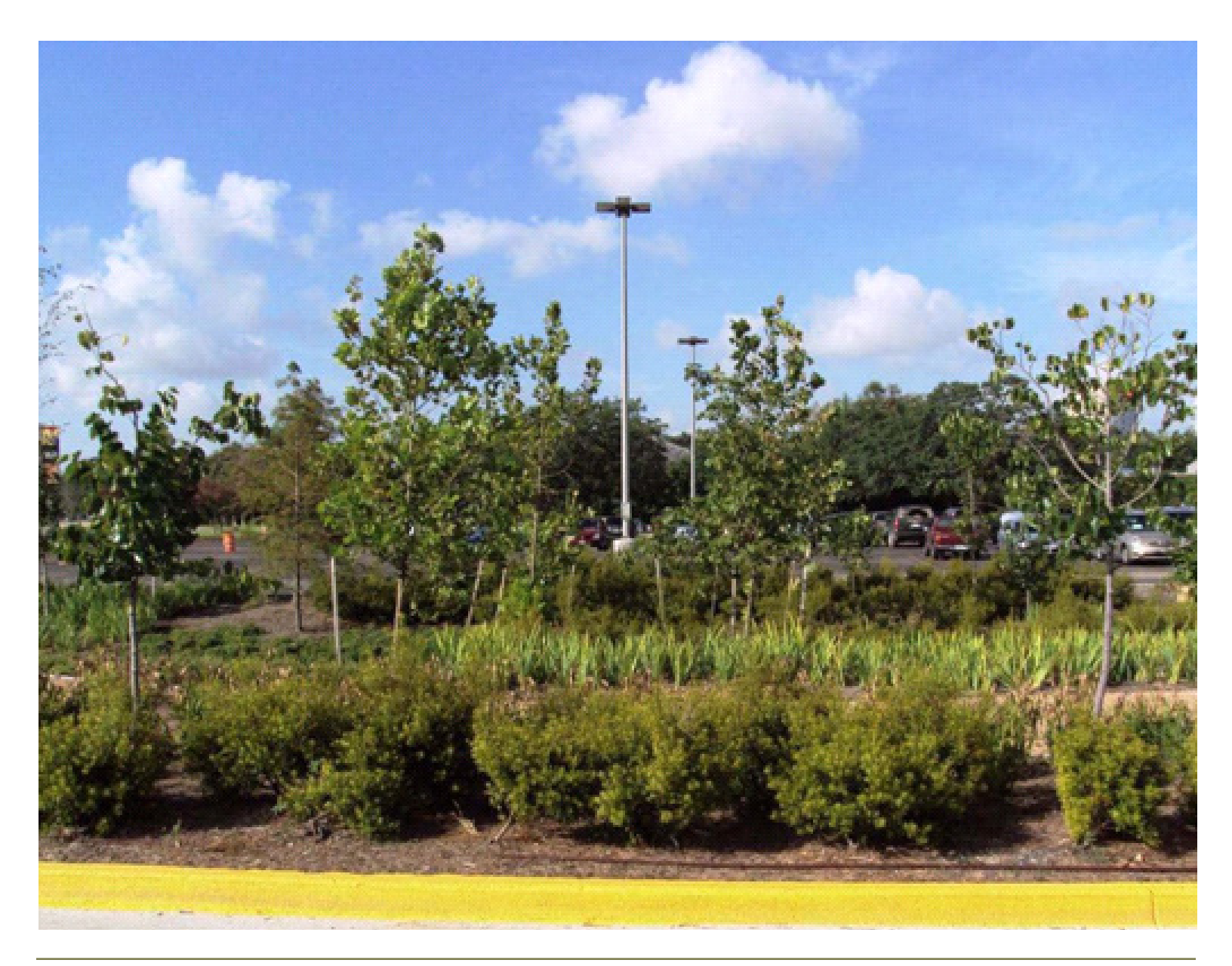
Houston-Galveston Area Council Parks and Natural Areas Awards - 5

In 2008, the Parks and Natural Areas Committee Introduced four award categories: Planning Process, Policy Tools, Projects Under $500,000, and Projects Over $500,000.