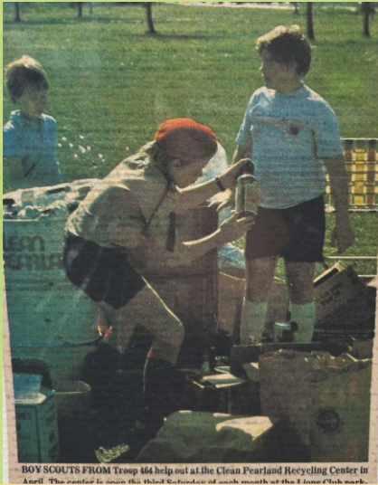
BOY SCOUTS FROM Troop 464 help out at the Clean Pearland Recycling Center in April. The center is open the third Saturday of each month at the Lions Club mark.

1982- Organized and ran the first recycling program in Pearland in the Lions Club parking lot