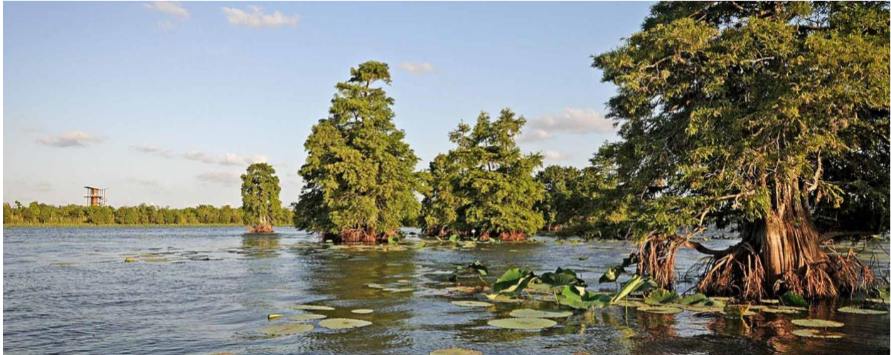
Texas Parks and Wildlife