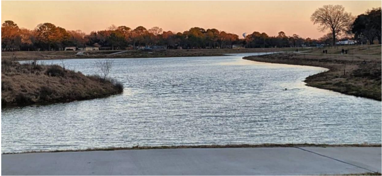
Exploration Green Conservancy