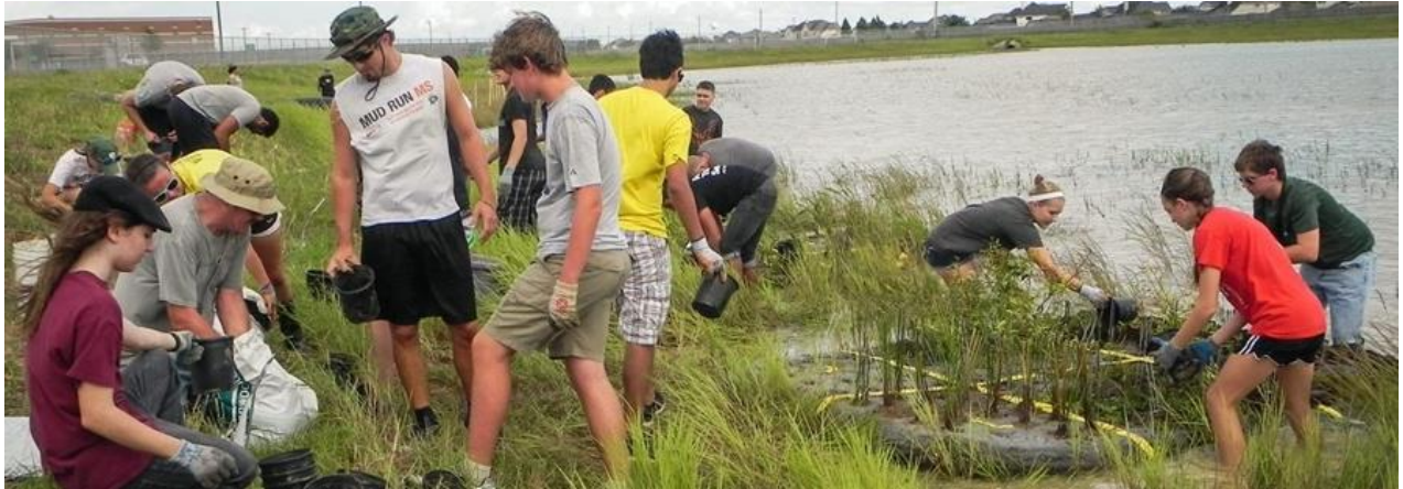
University of Houston, Clear Lake