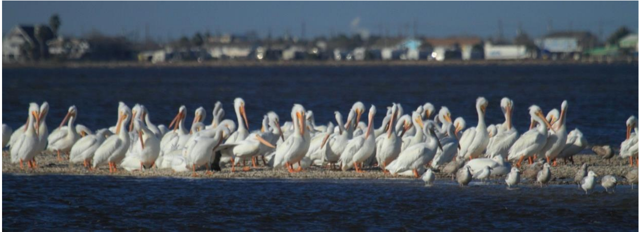
The Nature Conservancy