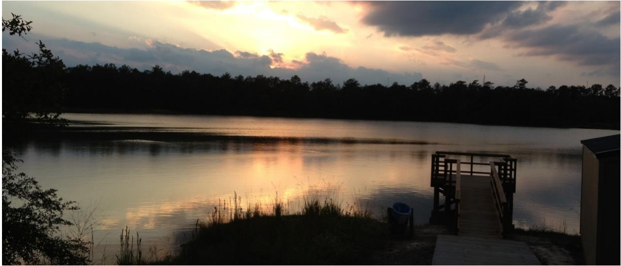
Timber Lane Utility District