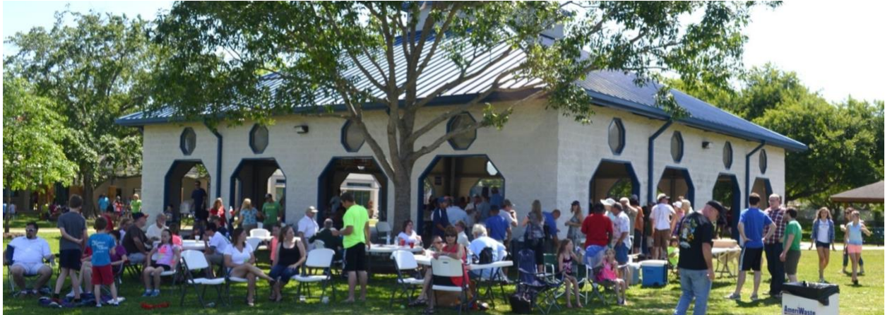
City of El Lago