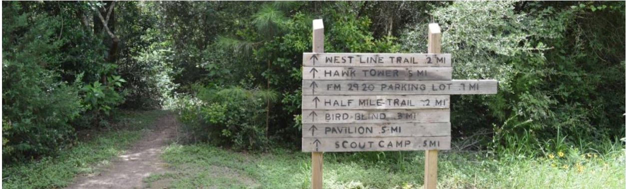
Places to Visit in Tomball, Houston Prime Realty