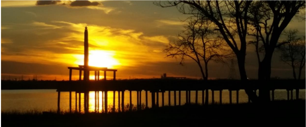
Baytown Nature Center