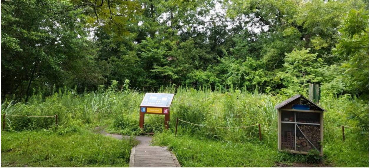
Nature Discovery Center