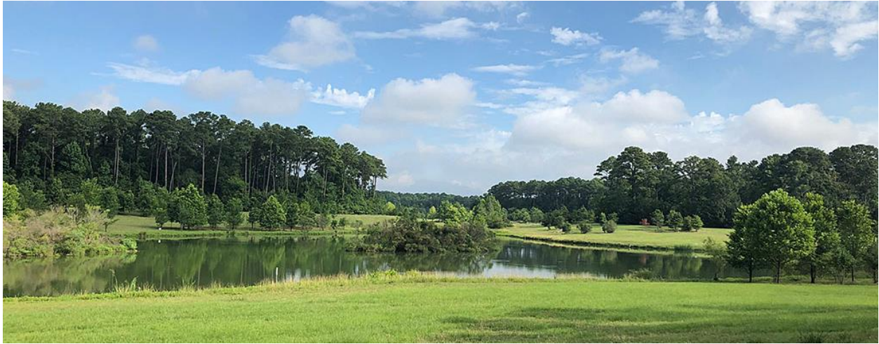
East Aldine District