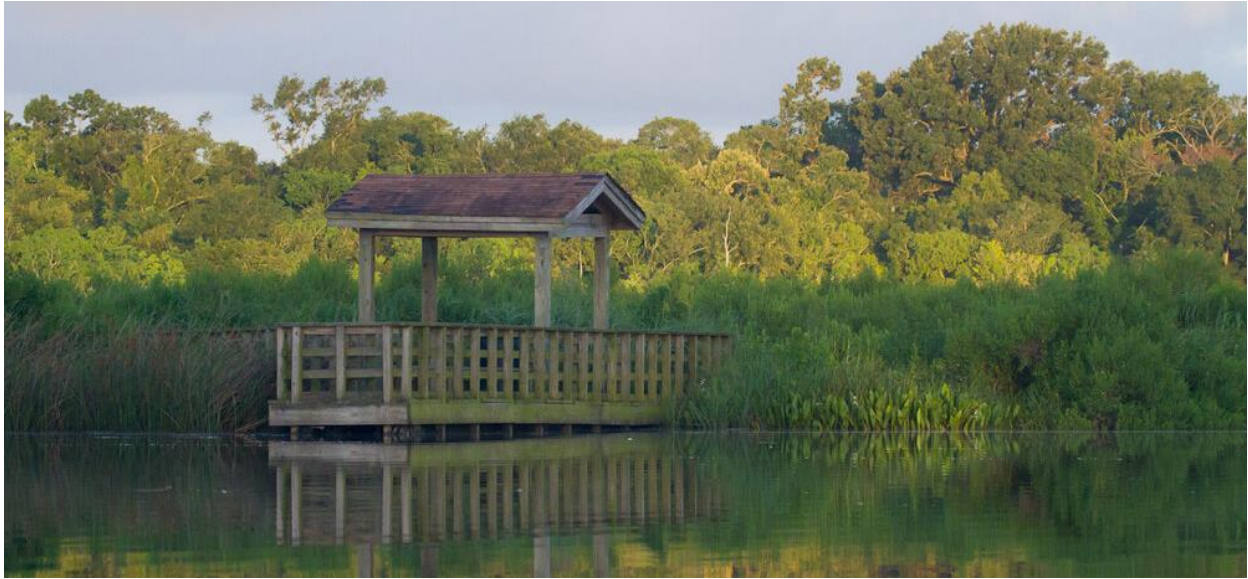
Armand Bayou Nature Center