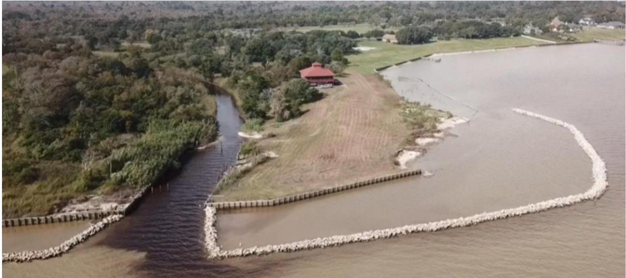
Galveston Bay Estuary Program