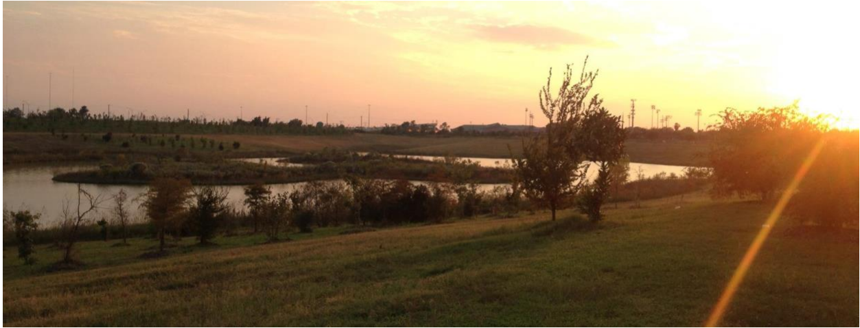
Willow Waterhole Greenspace Conservancy