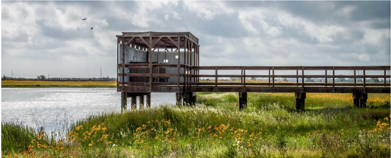
Harris County Precinct 3