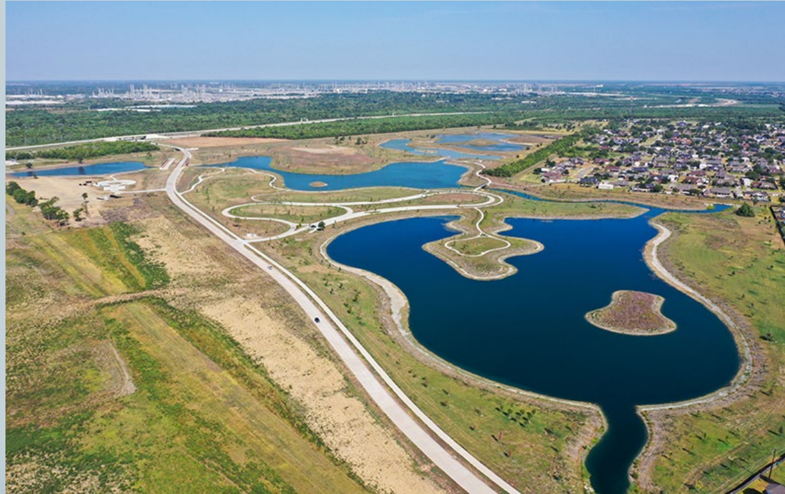
Hackberry Park Phase I City of Mont Belvieu