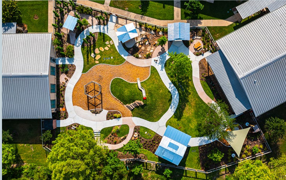
Oak Creek Exploration Zone at The Parish School The Parish School