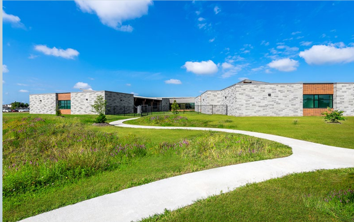
Alief Jefferson Early Learning Center Alief ISD