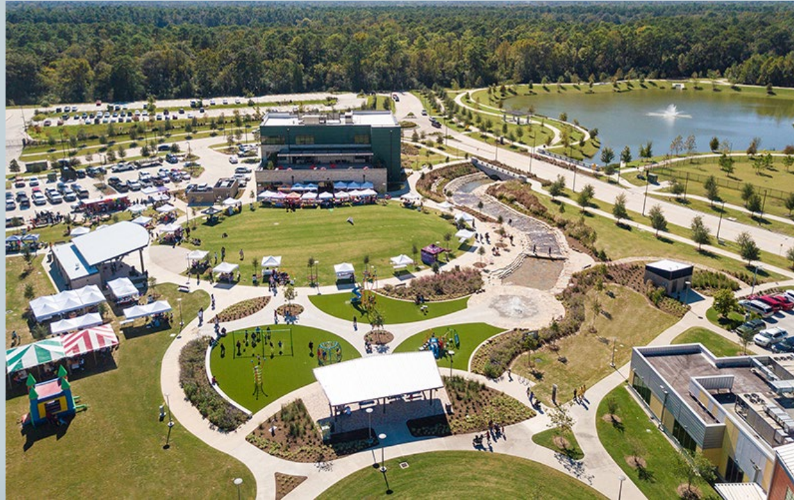
East Aldine Town Center East Aldine Management District