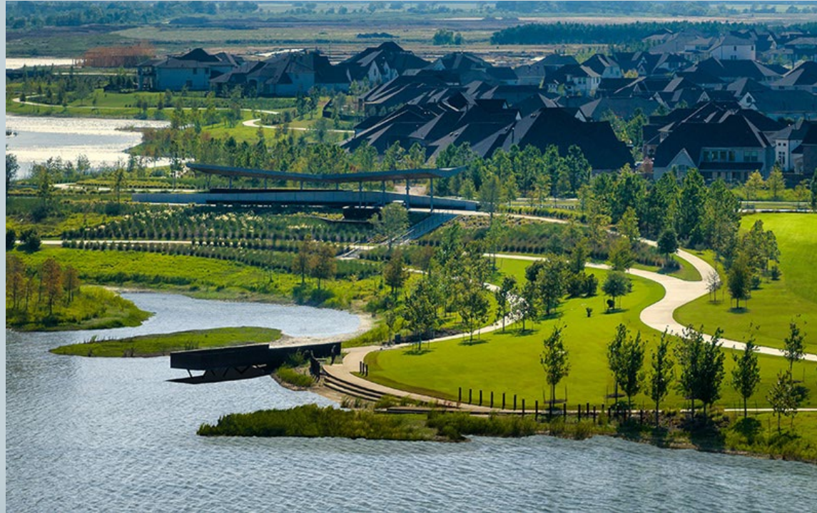
Chrysalis Lake Howard Hughes