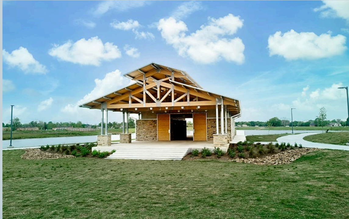
Lakeside Park City of Angleton