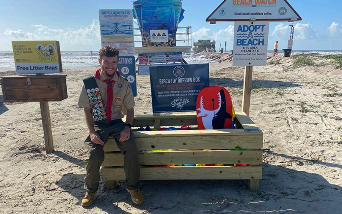
Beach Toy Borrow Boxes Galveston Island Park Board