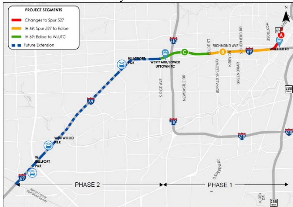
FIGURE A – IH 69 Two-Way HOV

The Two-Way HOV project will be located in TxDOT right-of-way. METRO is working closely with TxDOT throughout the planning, preliminary design, and environmental analysis process to ensure design and construction compatibility and that appropriate FTA and FHWA standards are met.