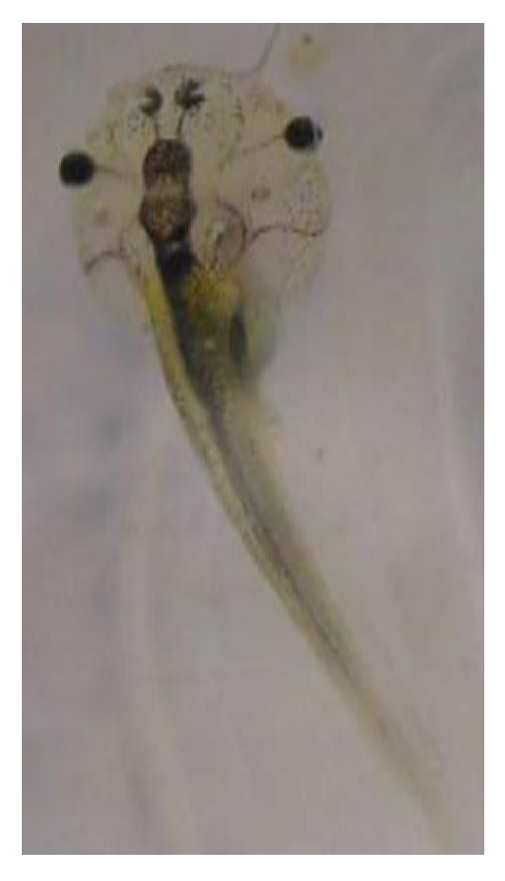
38 ppb Prozac