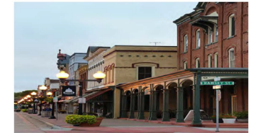
Unique street materials