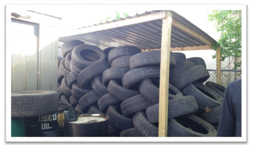
Not all tires are covered