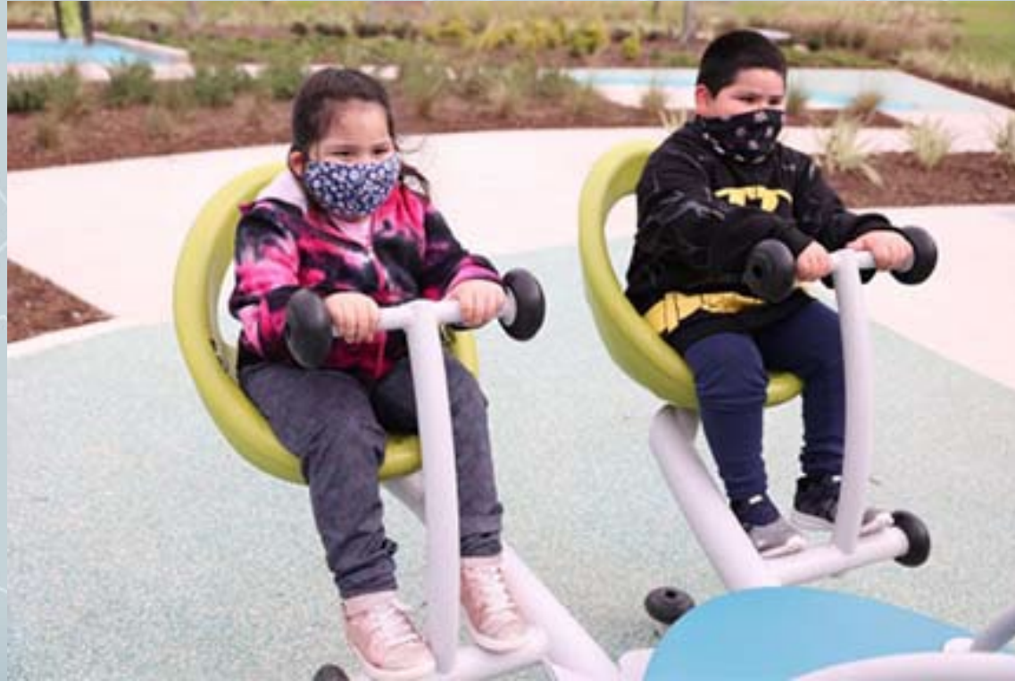
James Driver Inclusive Park Harris County Precinct 2