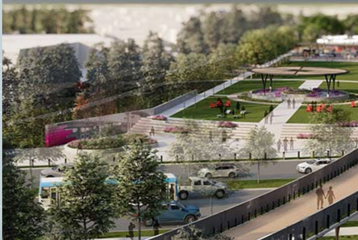
John R. Harris Park Harris County Precinct 2