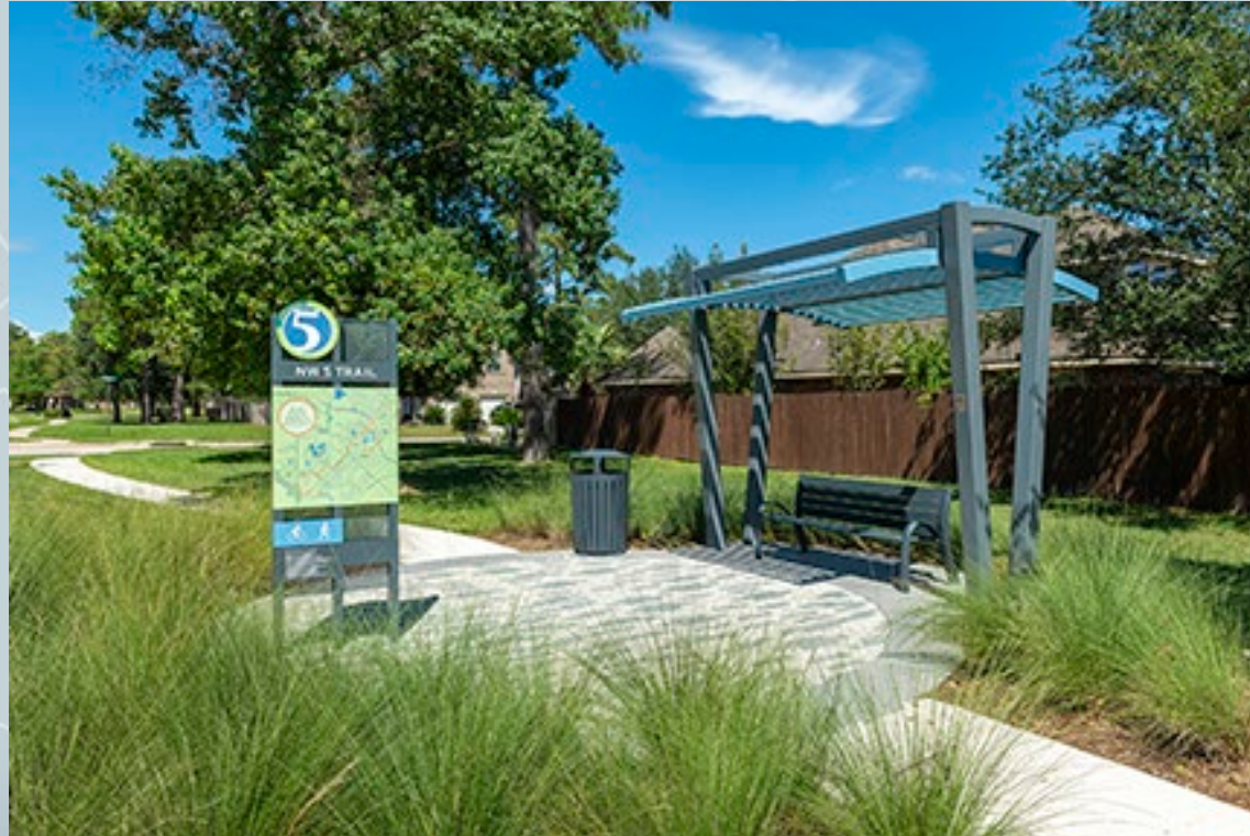
Northwest Harris County MUD 5 Trails Improvements Northwest Harris County MUD 5