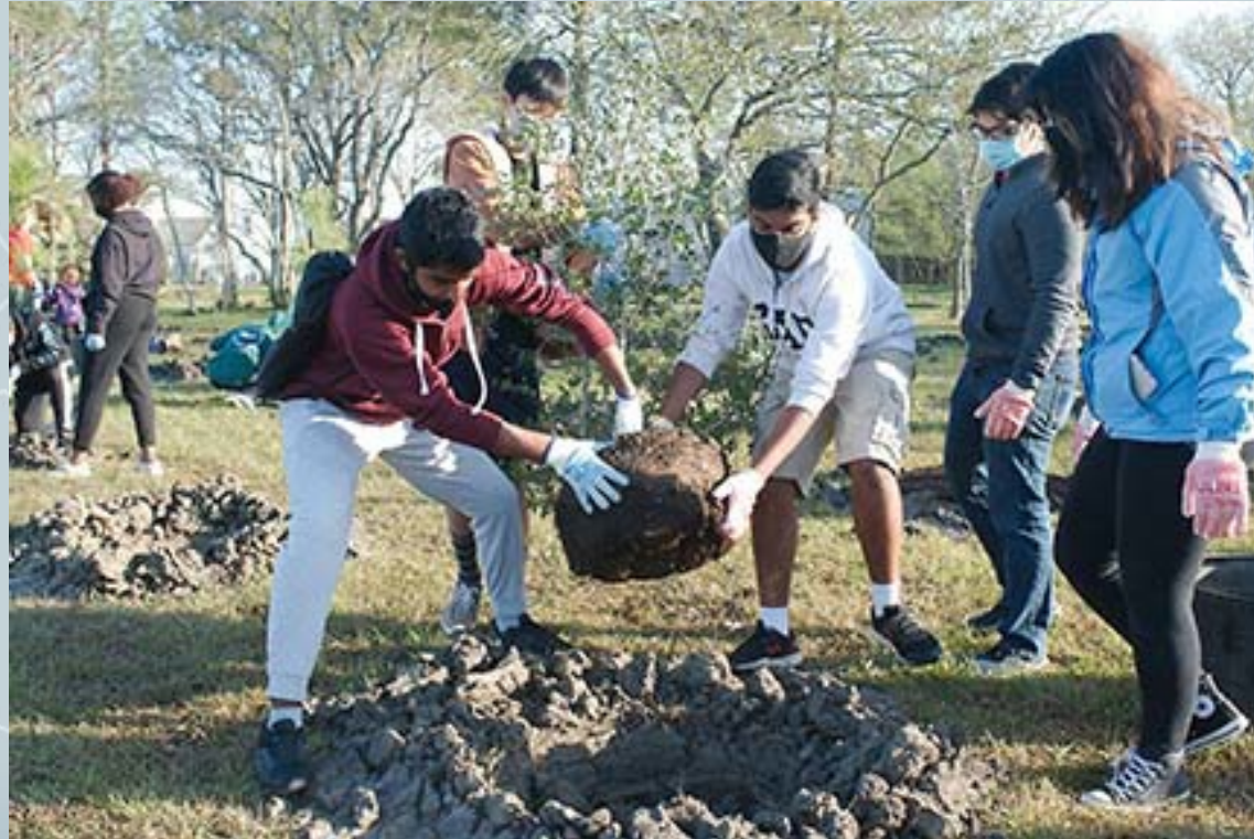
JHEC Reforestation City of Pearland