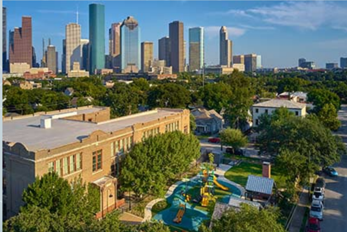
Dow Elementary School Park Old Sixth Ward Redevelopment Authority