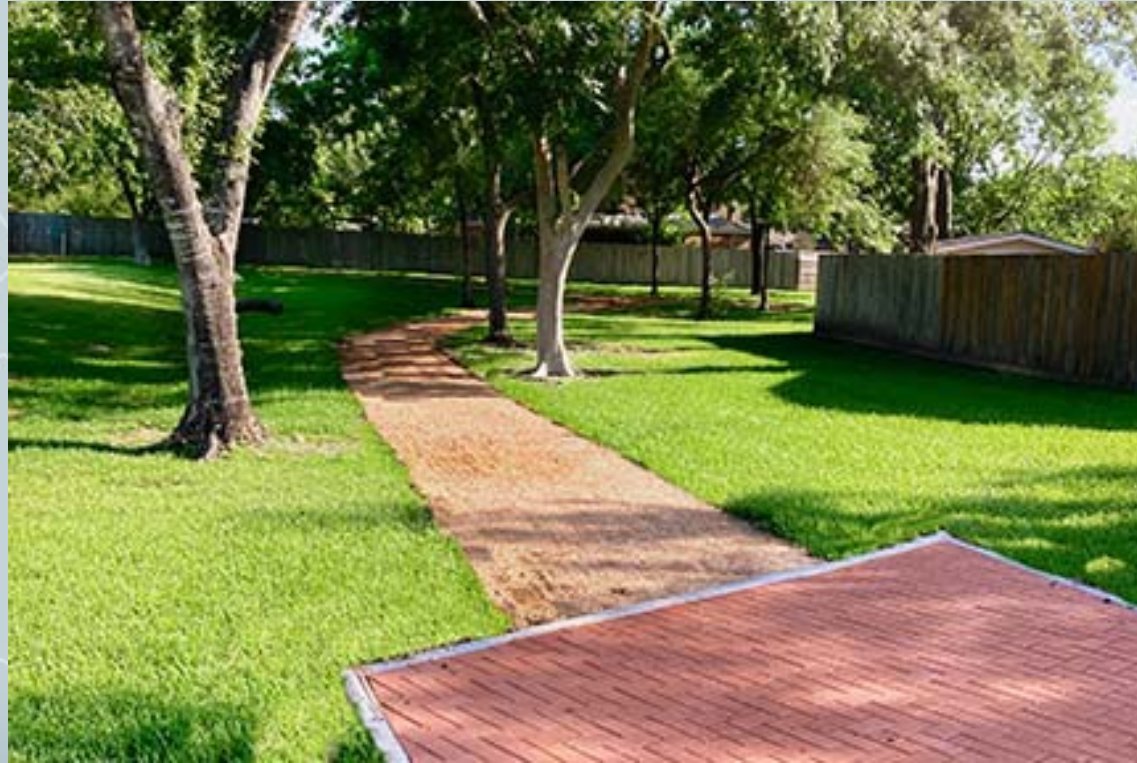
Northeast Hike and Bike Trail City of Deer Park