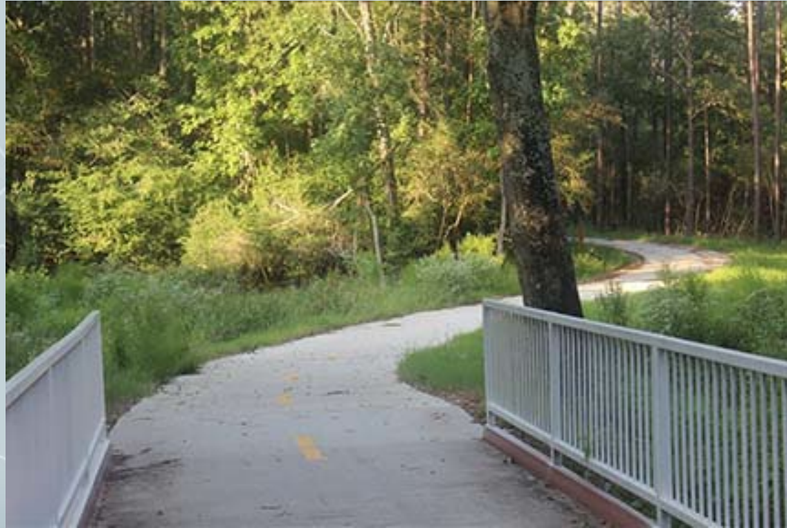
Final Segment - Cypress Creek Hike and Bike Trail Timber Lane Utility District