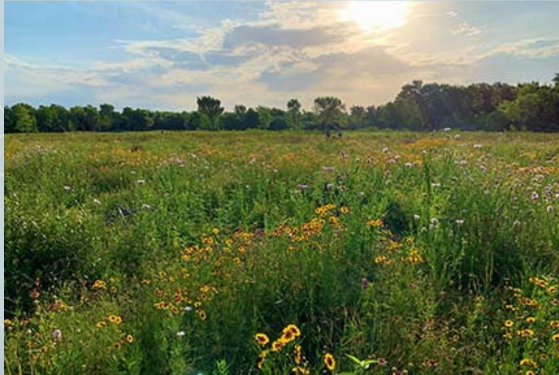
Sylvan Rodriguez Park Habitat Restoration Project Houston Parks and Recreation Department (HPARD)