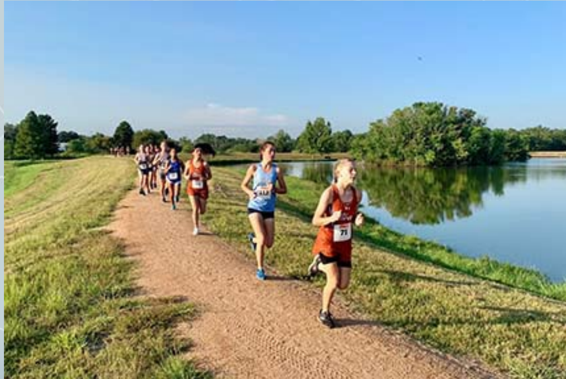
Resoft County Park Trail Development Brazoria County Parks Department