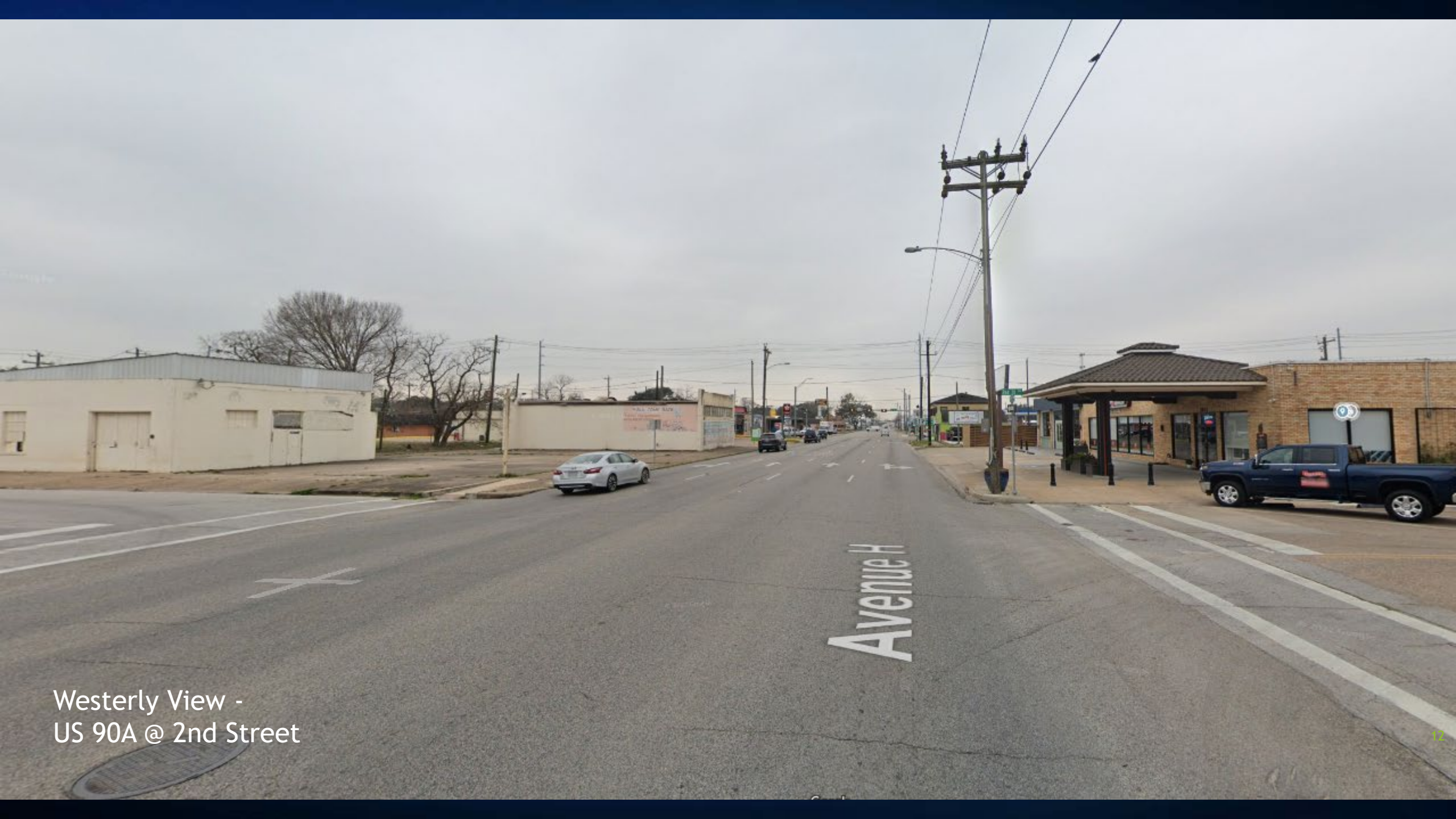
Westerly View - US 90A @ 2nd Street