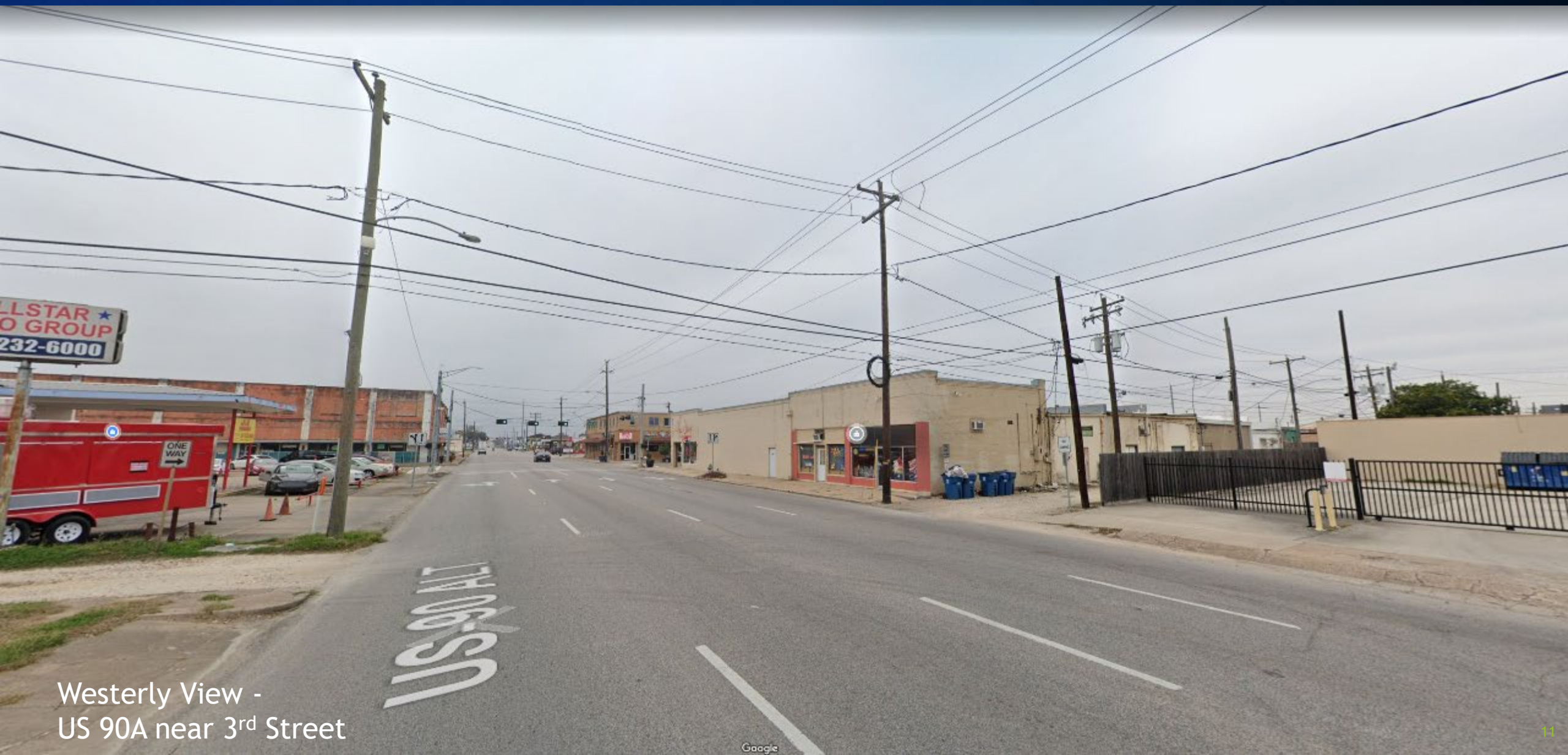
Westerly View - US 90A near 3 rd Street