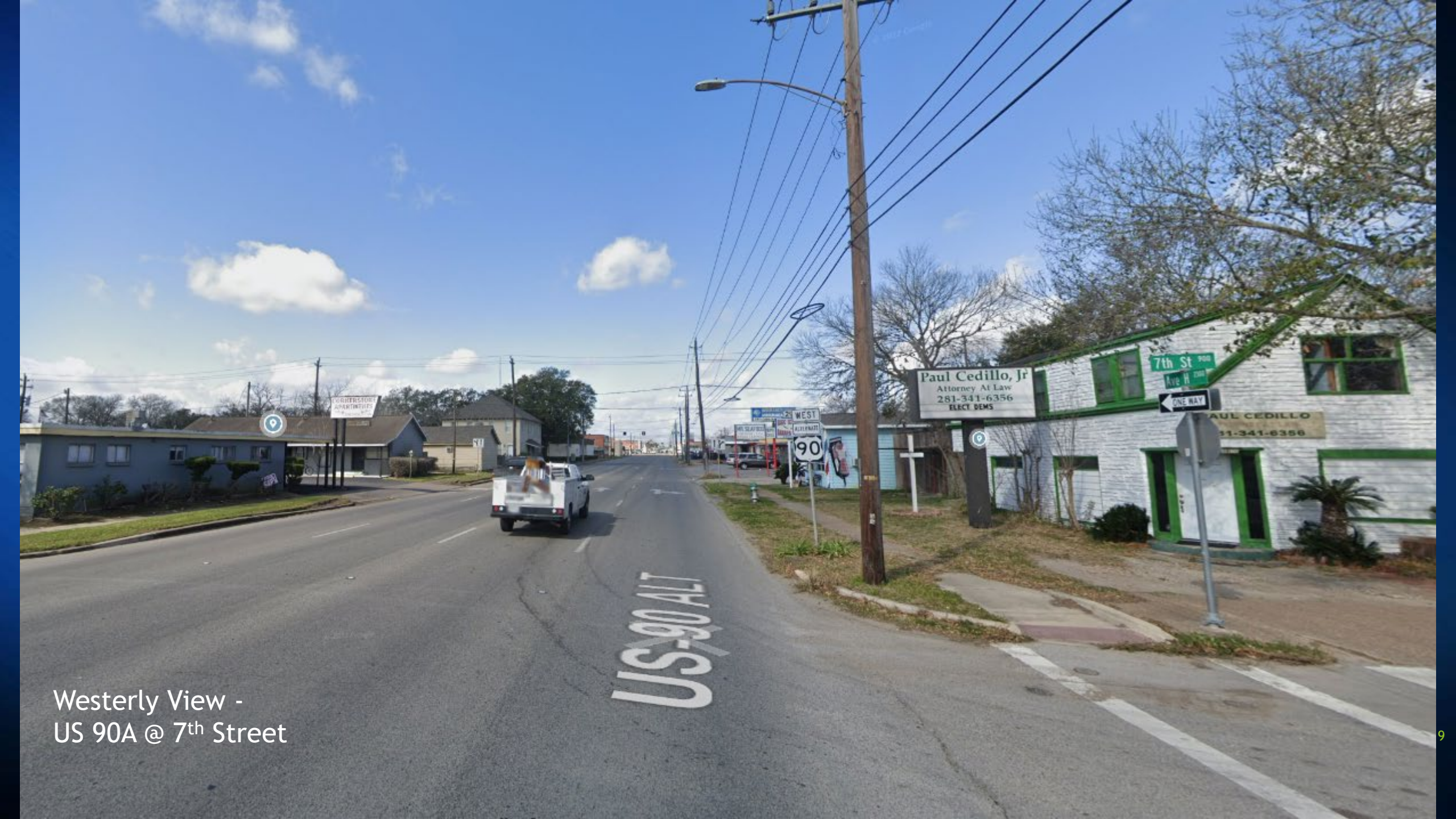
Westerly View - US 90A @ 7 th Street