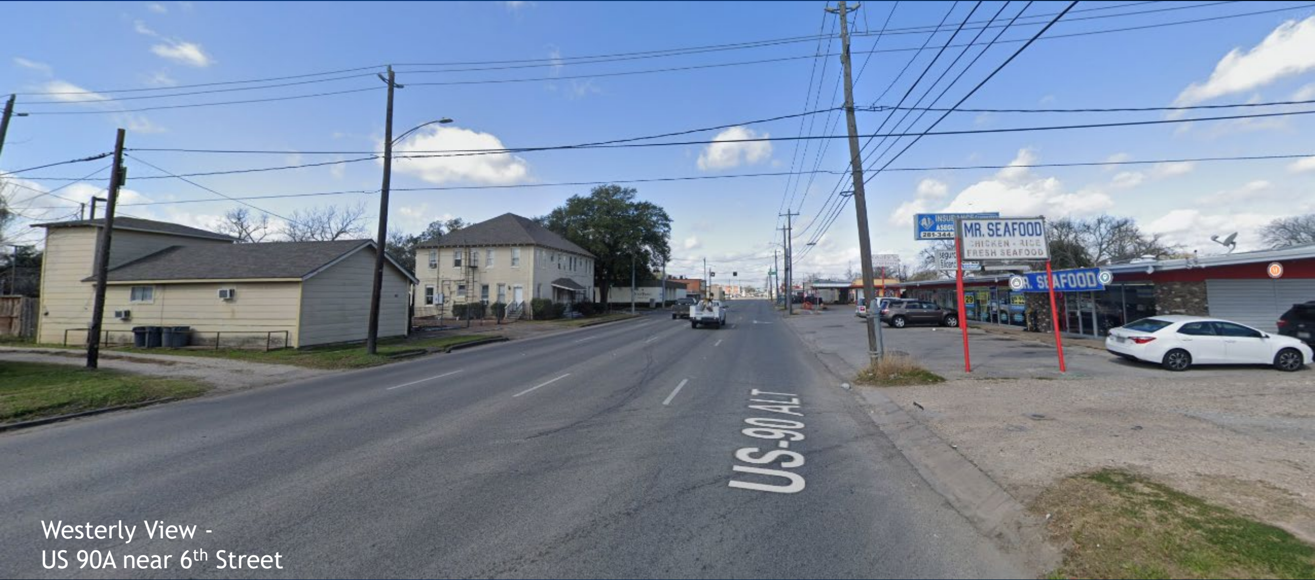
Westerly View - US 90A near 6 th Street