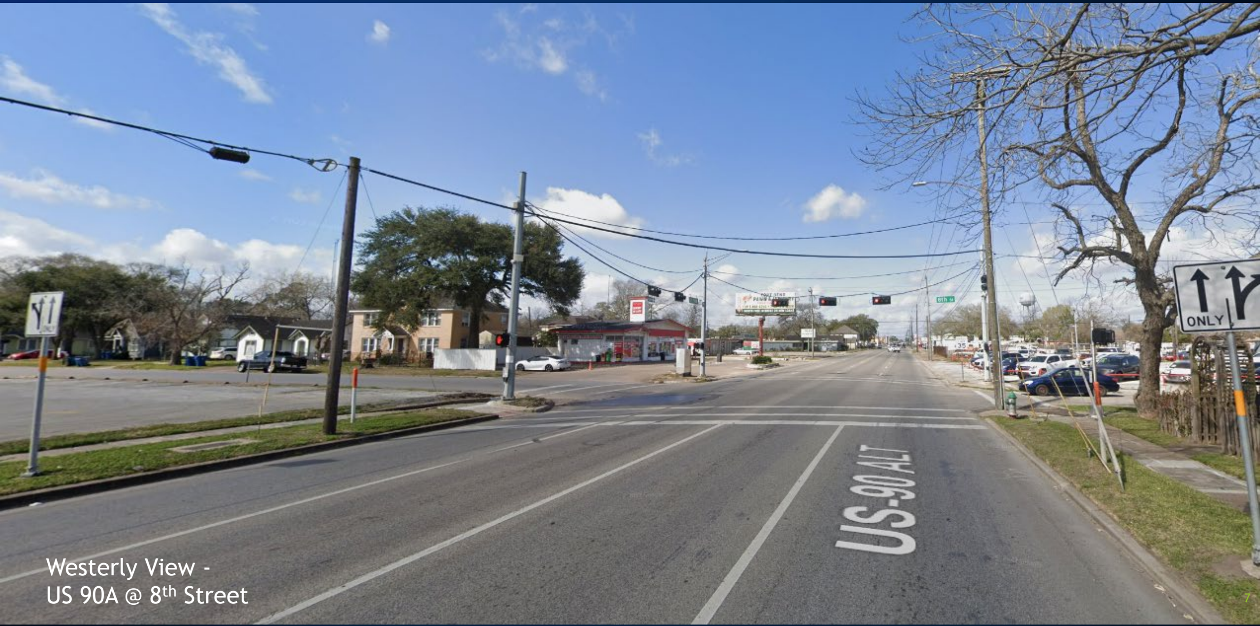
Westerly View - US 90A @ 8 th Street