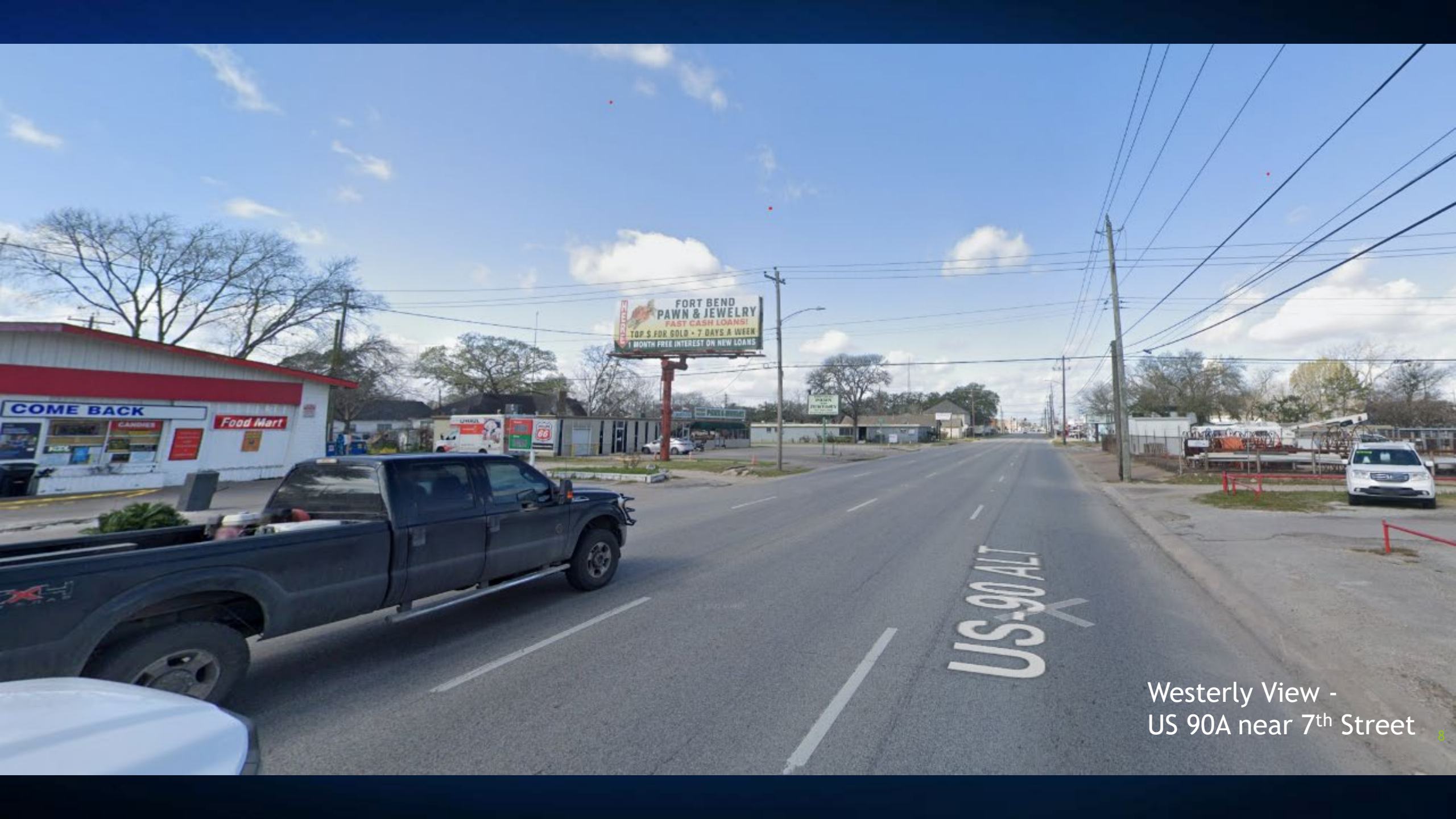
Westerly View - US 90A near 7 th Street