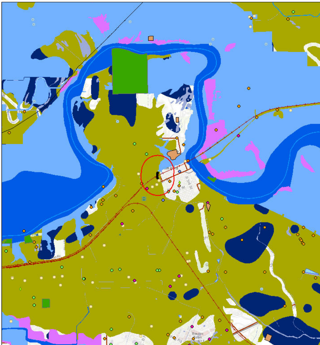
Letter ANSI A Portrait

Jan 22 2024 15:25:30 Central Standard Time