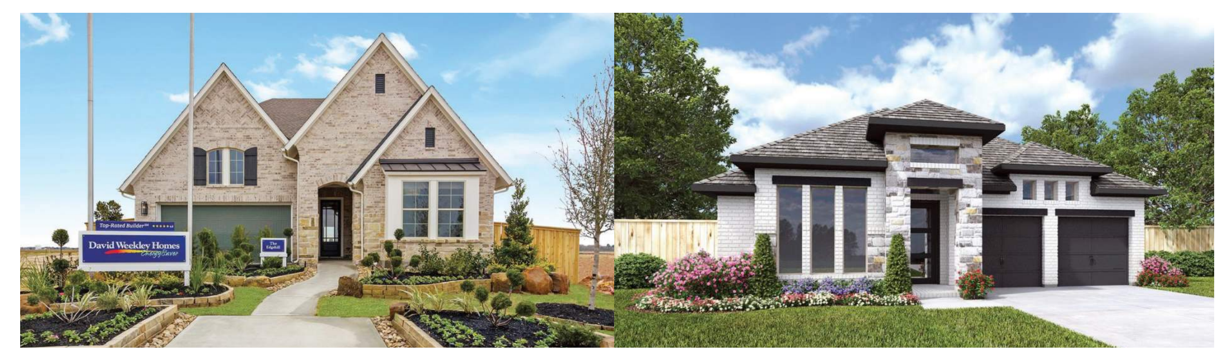
RICELAND SINGLE FAMILY HOMES (EXTERIOR EXAMPLES ONLY)

RICELAND COMMERICAL DEVELOPMENT (DESIGN RENDERING)